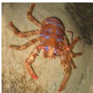
Galathea strigosa Caranguejo-diabo