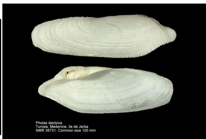
Natural History Museum Rotterdam