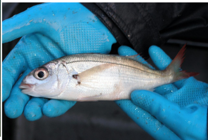
Vasco Ferreira Todos os direitos reservados