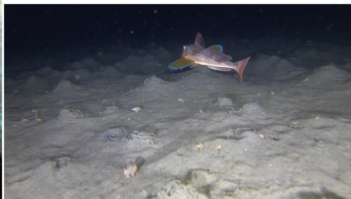
Vasco Ferreira Todos os direitos reservados