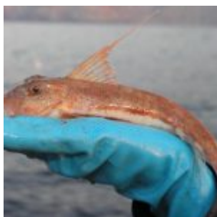
Chelidonichthys obscurus Cabra-de-bandeira