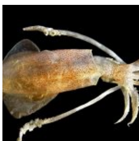
Loligo vulgaris Lula-comum