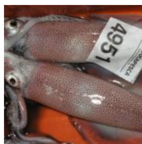
Alloteuthis subulata Lula-bicuda-comprida