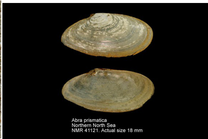
Abra prismatica Northern North Sea NMR 41121. Actual size 18 mm